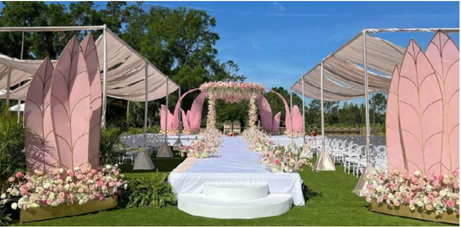
THE 19TH GREEN

Experience a private outdoor venue with picturesque backdrop of greenery and nature.