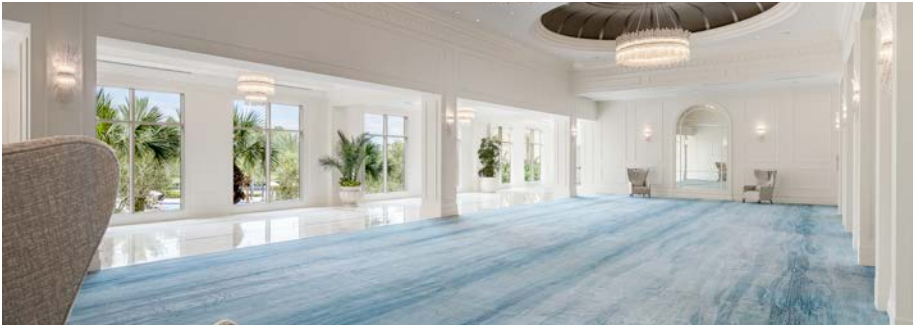
CENTRAL PARK BALLROOM

Central Park Ballroom exudes elegance and sophistication, offering a foyer complete with VIP entrance for every guest.