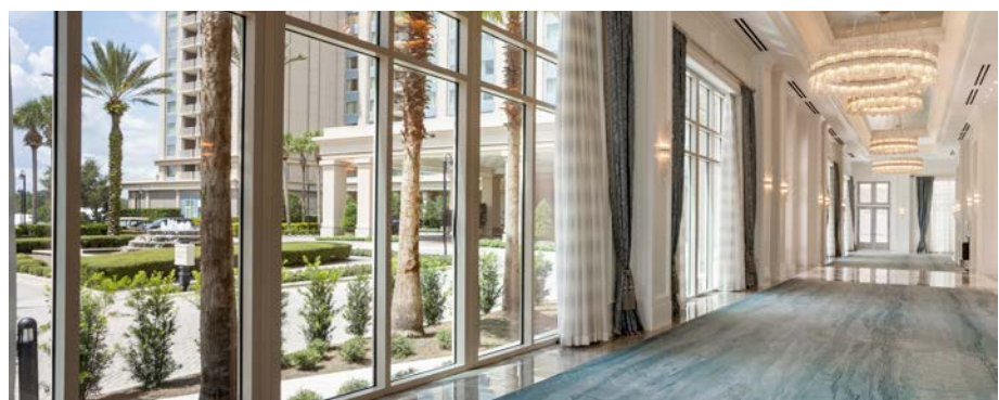
CENTRAL PARK BALLROOM Central Park Ballroom exudes elegance and sophistication, offering a foyer complete with VIP entrance for every guest.