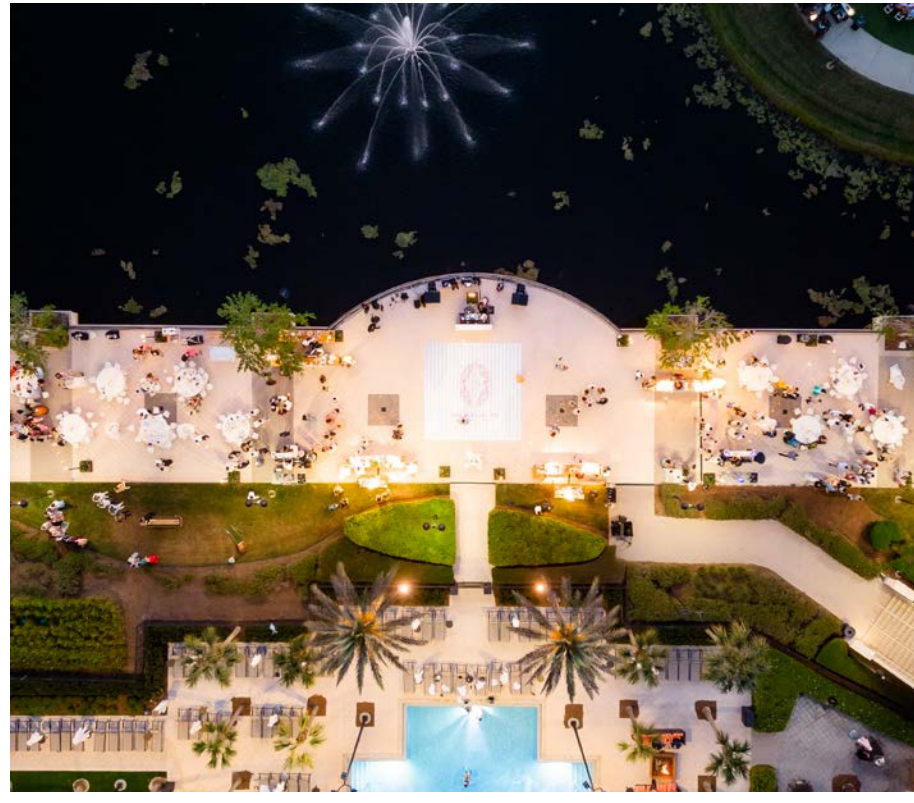
THE PROMENADE This enchanting terrace sets the scene for picture perfect Baraat Pathway, or evening welcome reception.