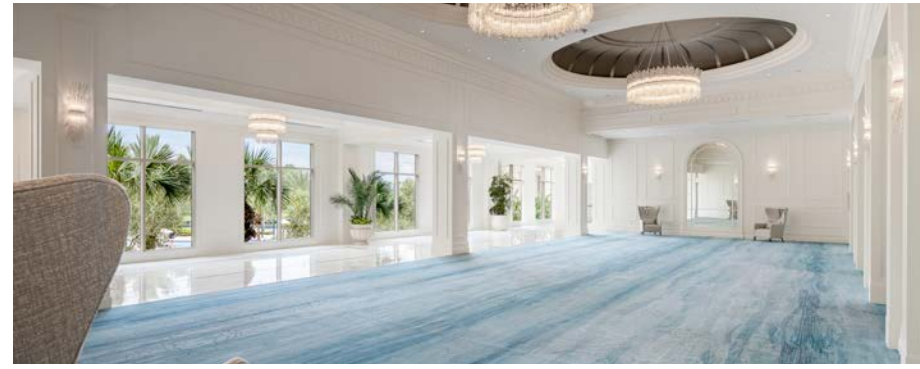
GRAND BALLROOM This stunning venue provides an enchanting setting with a formal foyer for your grand event.