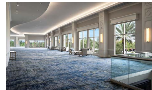
BONNET CREEK BALLROOM This beautiful venue offers a magical atmosphere, complete with a formal foyer perfect for your magnificent event.