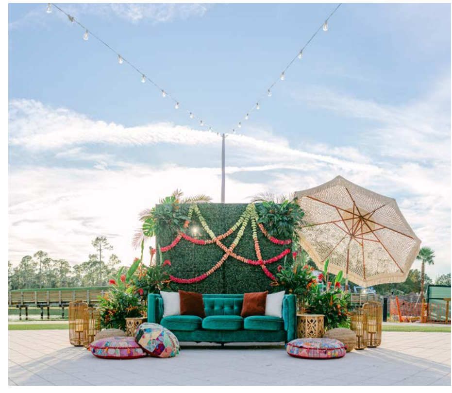
WATERSIDE PATIO Start your forever at this charming patio, with a beautiful nature preserve backdrop for your special day.