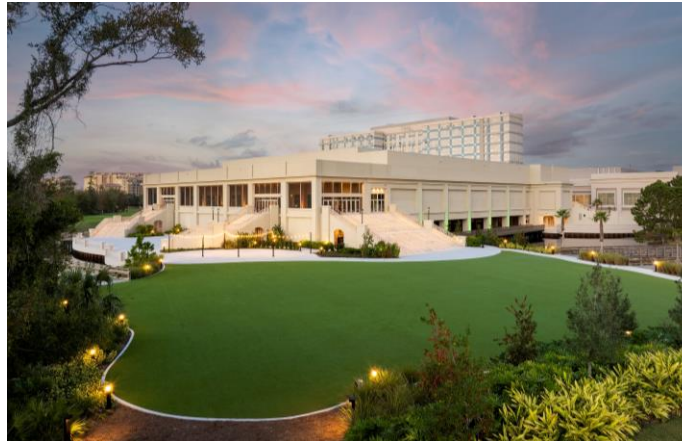
The 19 th Green