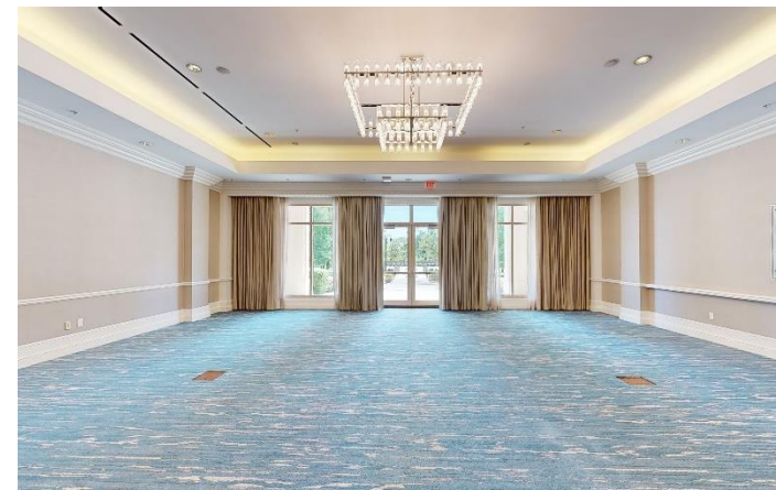
Intimate Gathering Rooms