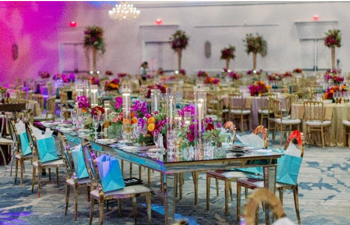
Bonnet Creek Ballroom

Elegance and sophisticated style await, with magnificent chandeliers to the lasting impression of rich appointments with each of our indoor ballrooms and gathering spaces, to create the perfect backdrop to your dream wedding.