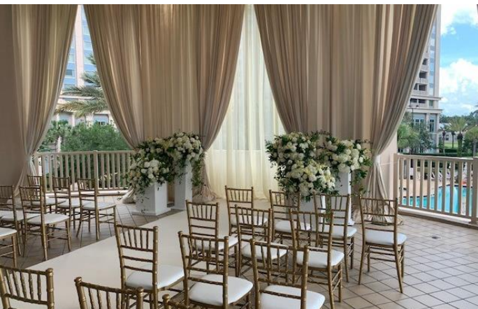
South Floridian Terrace