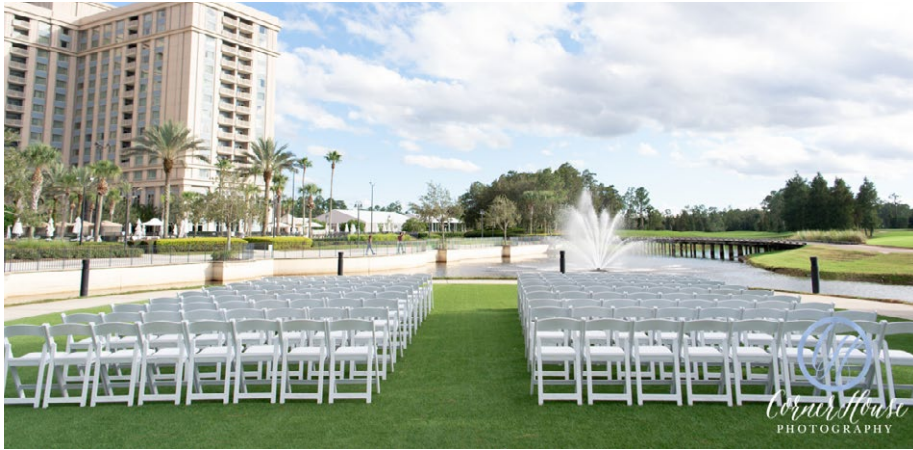
SIGNATURE ISLAND Experience sweeping views of the resort's waterways and golf course, reflecting a magnificent venue for sunset weddings.