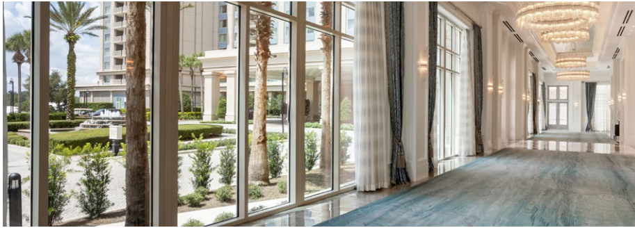
CENTRAL PARK BALLROOM Central Park Ballroom exudes elegance and sophistication, offering a foyer complete with VIP entrance for every guest.