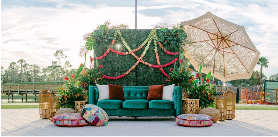
WATERSIDE PATIO Start your forever at this charming patio, with a beautiful nature preserve backdrop for your special day.