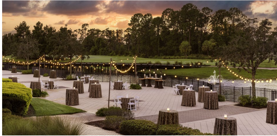
THE PROMENADE This enchanting terrace sets the scene for picture perfect sunset ceremonies or outdoor receptions under the stars