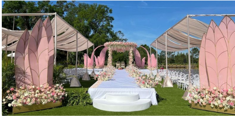
THE 19TH GREEN Experience a private outdoor venue with picturesque backdrop of greenery and nature.