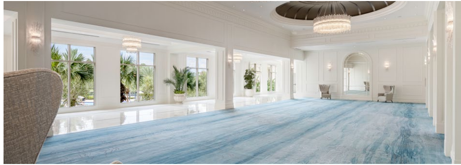
GRAND BALLROOM This stunning venue provides an enchanting setting with a formal foyer for your grand event.