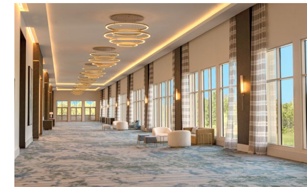
CENTRAL PARK BALLROOM Central Park Ballroom exudes elegance and sophistication, offering a foyer complete with VIP entrance for every guest.