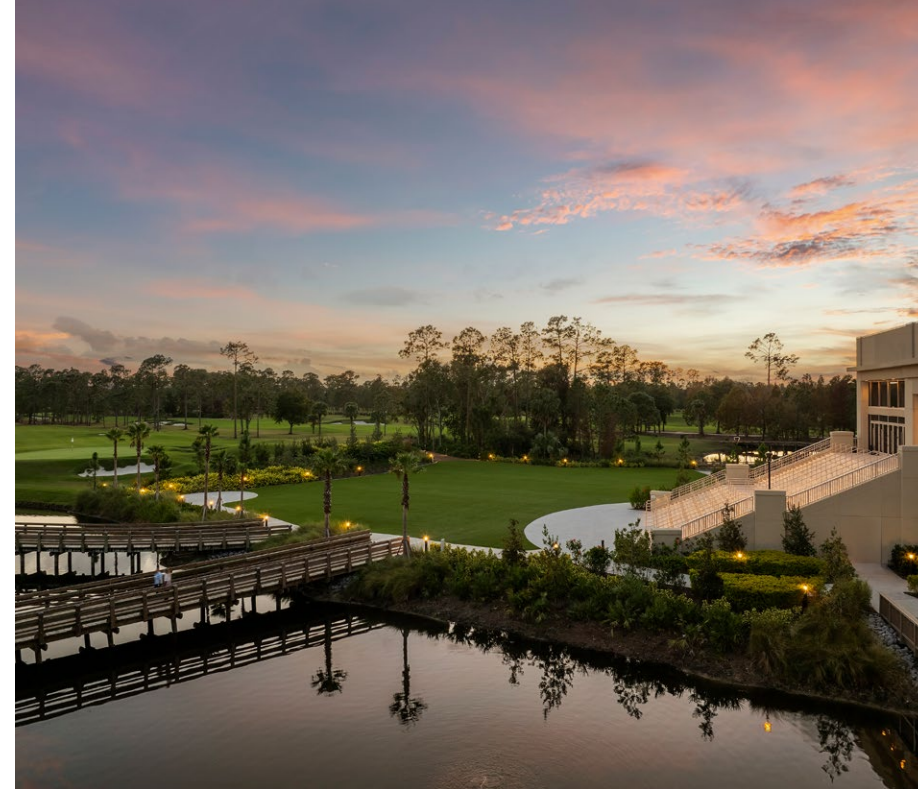
THE 19TH GREEN

Experience a private outdoor venue with picturesque backdrop of greenery and nature.