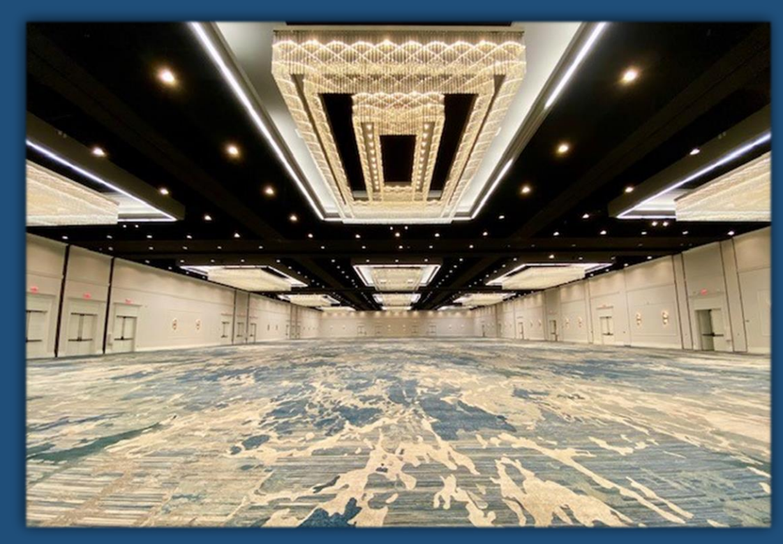
Bonnet Creek Ballroom